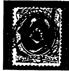
Handcarved cork cancels of the Freemasonry Symbol graced the stamps mailed at some early post offices. This 1875 Jackson definitive (Scott # 178) sports a nice example.

This is a small sampling of two of my favorite subjects, stamps and